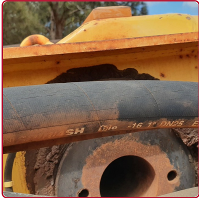
winch hoses are perished