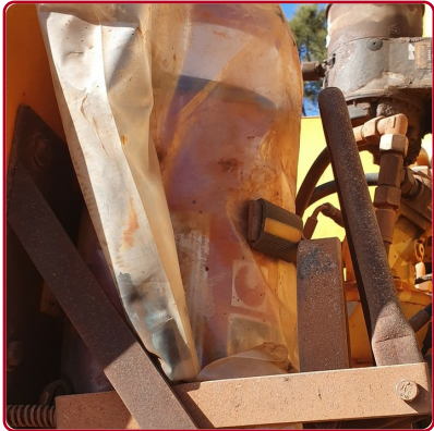
vessel older than 5 years