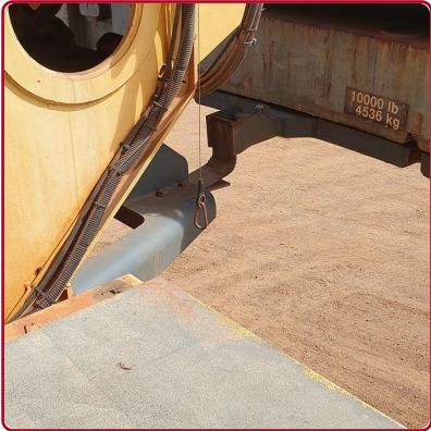
Precision length reel is seized