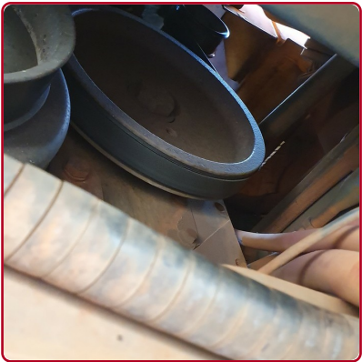
Airconditioner belt is loose