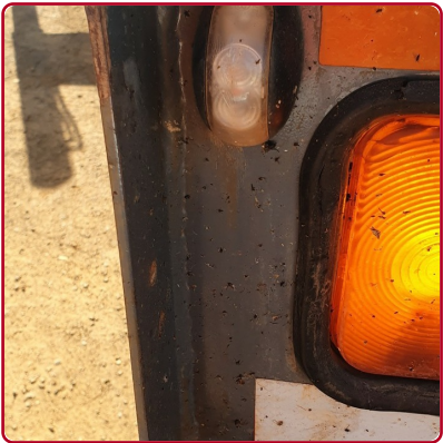
Left habd park light