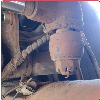
front left hand steering cylinder tie rod end bushes are perished