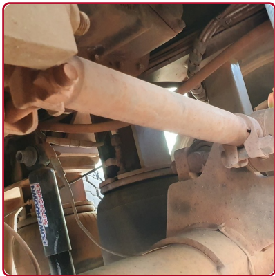
tie rod ends chassi to 2nd axle torque arm