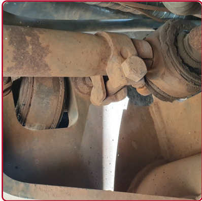
Front left hand torque arm rear bush is perished