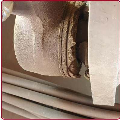
2 nd axle steer cylinder tie rod ends are perished